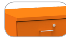
1" TFL top (Classic) 1" HPL top (Premium)