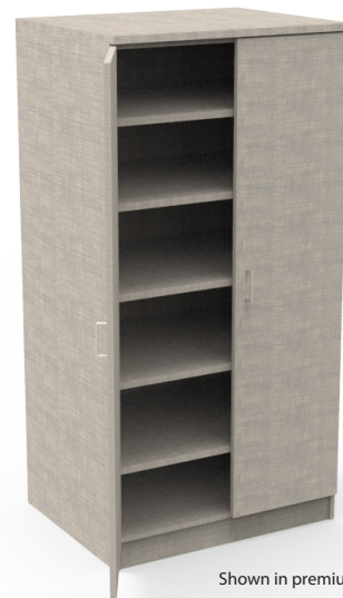
RT3232 Shown in premium finish