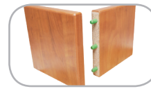
.75" fully doweled casebody construction

Shipping Class: Density Based Class NMFC#: 80440