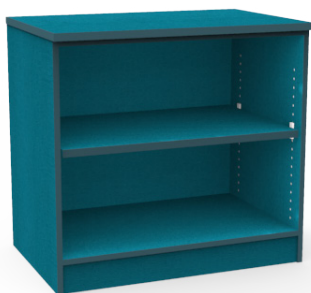
RB1140 Shown in premium finish

For a complete listing of cabinets please see our catalog.