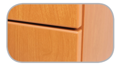
3mm PVC edgebanding on casebody, drawer fronts and doors