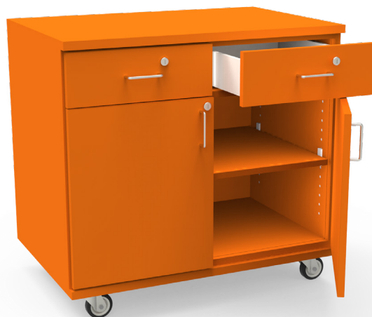
CRB2400 (shown with optional locks)

For a complete listing of cabinets please see our catalog.