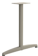
Part # 5088 or 5092 DuraCast T-Base