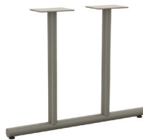
Part # 7034 or 036 Tubular TT-Base