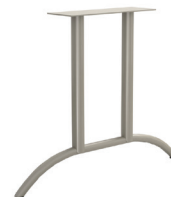
Part # 7236 Arch TT-Base